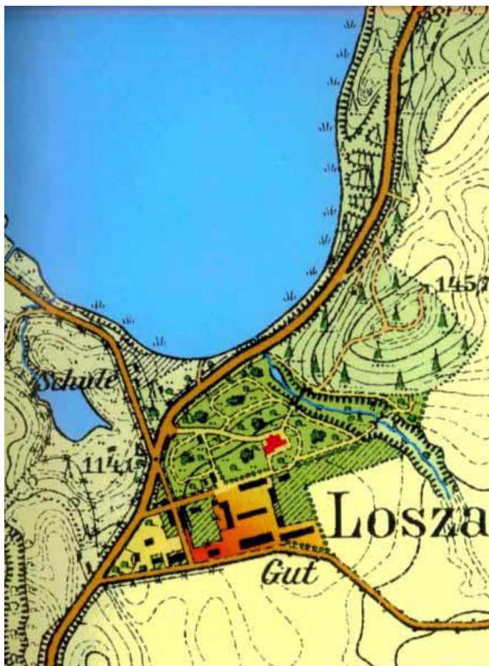
Fig. 1. Sketch of Łężany made before 1945 r.

On 10 th April 1954, the former manor of Łężany was taken over by the Higher School of Agriculture in Olsztyn (at present, the University