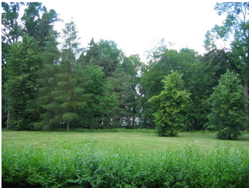
Phot.5. Meadow seen from the front of the palace overlooking the Legińskie Lake in Summer.