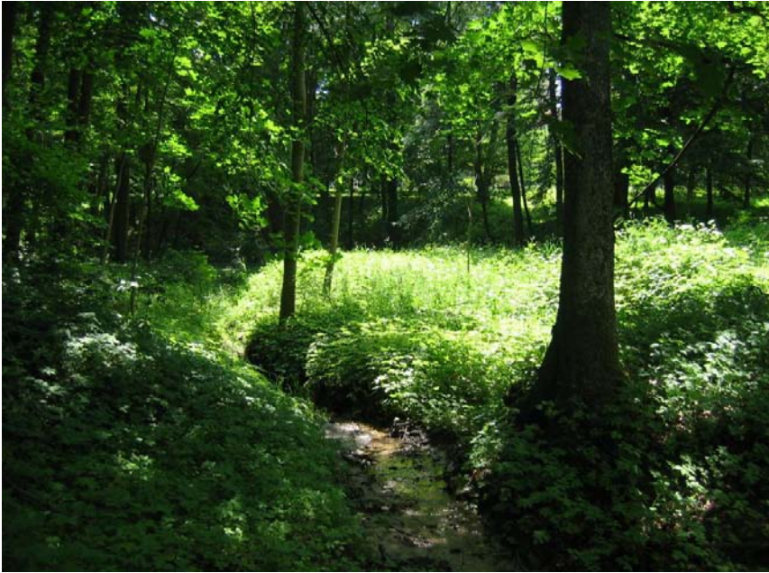
Phot.3. Stream forms a small pool. Source: A.Urban, September 2006