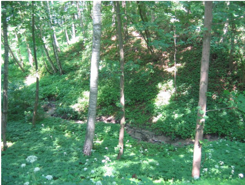
Phot.2. Stream seen from the edge of the gorge. Source: A.Urban, September 2006