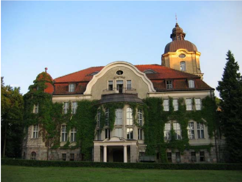
Phot.1. Front of the palace building. Source: A.Urban, August 2004