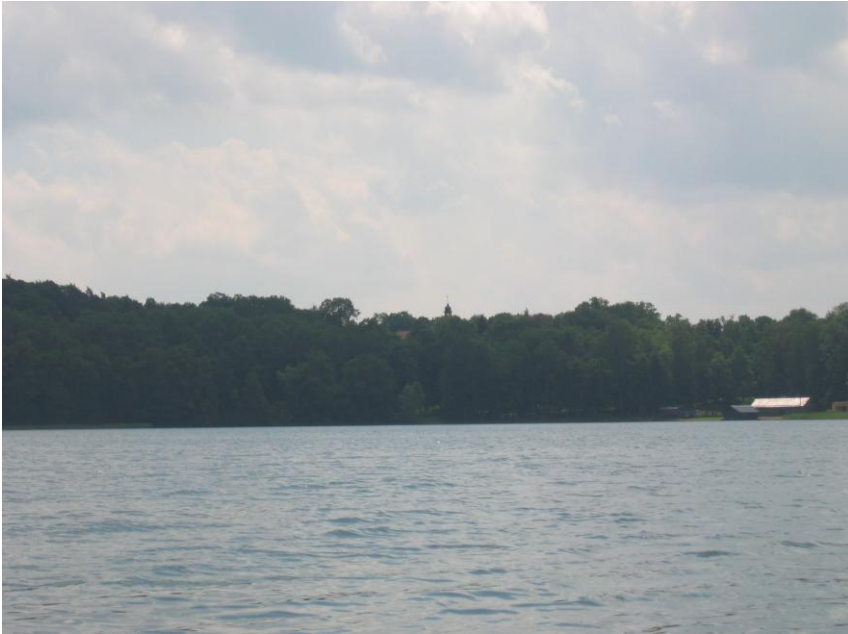
Phot. 7 View toward the palace on the axis linking the palace to the island.