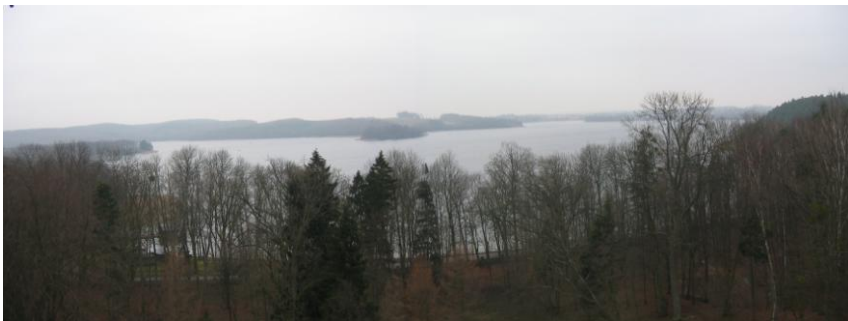
Phot.8 The view from the tower of palace on Lake Legińskie. The visible island is located on the axis leading through the central part of the building.