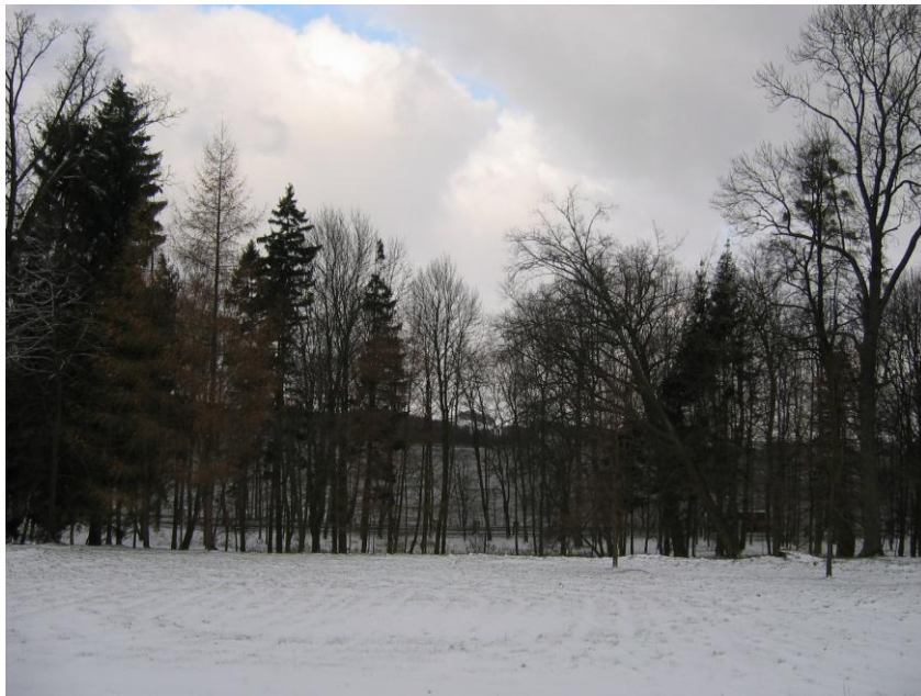
Phot.6. Meadow seen from the front of the palace overlooking the Legińskie Lake in Winter. Source: A.Urban, November 2004