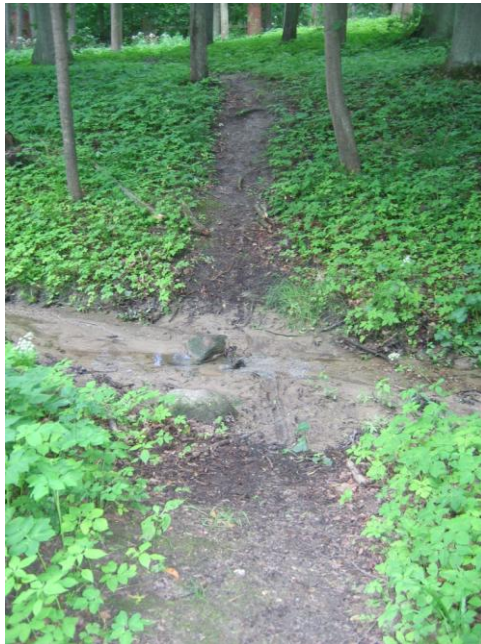
Phot.4 The stoned passage over the stream, close to the fence.