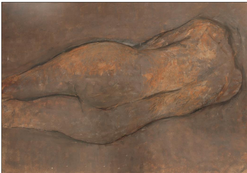
3. Marek Szczesny, Akt brązowy , rysunek sepią na papierze, 70x100 cm (2016)

with other fields of art. The abstract figures connected with the idea of music referred to the symphonic alignment of colours 3 .