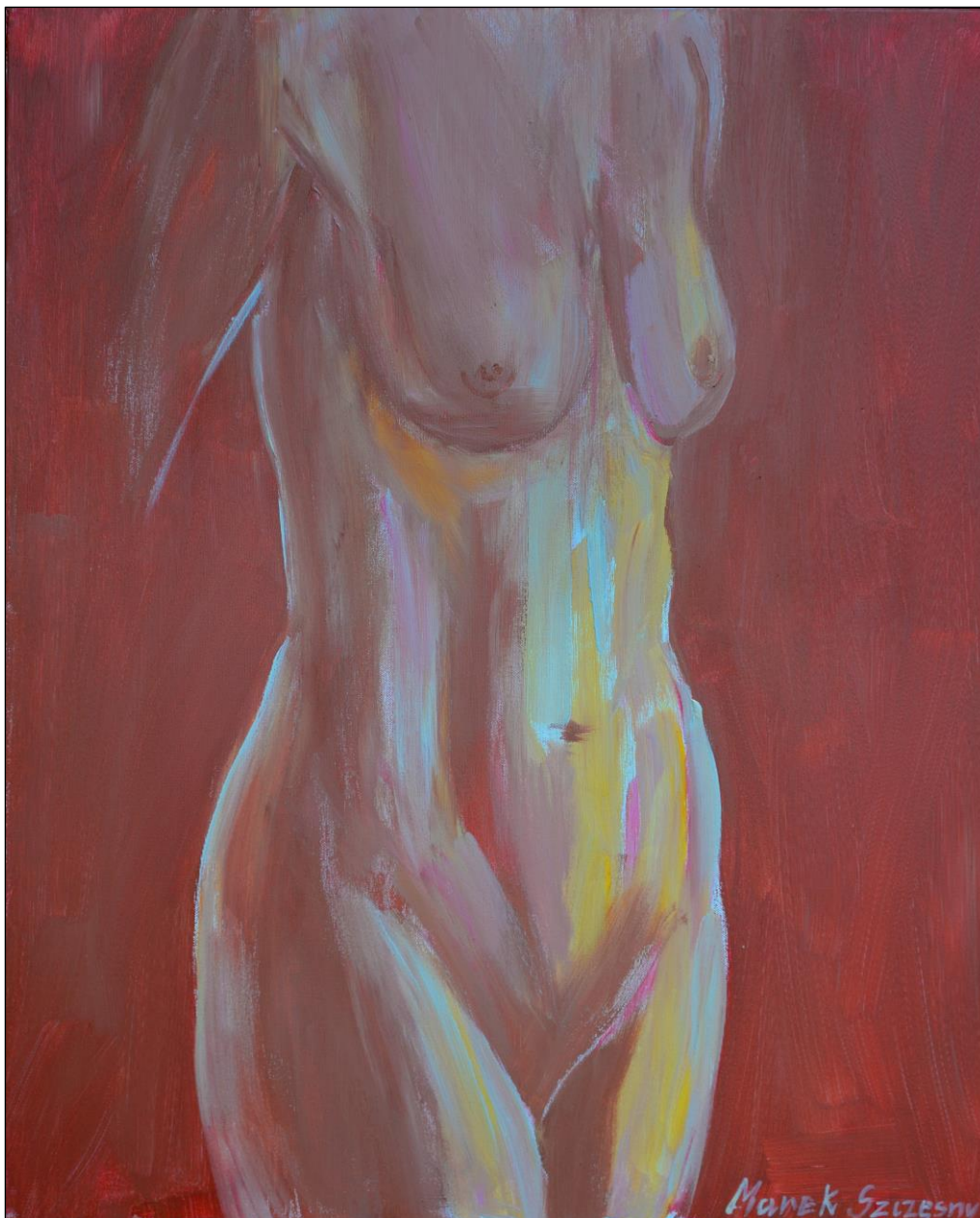
6. Marek Szczesny, Akt siena , akryl na płótnie, 80x70 cm (2019)

His works are not easy to understand and interpret. They call for attention and focus; it must be noted that his language is rich in value nuances and an ambitious textural structure of the drawing.