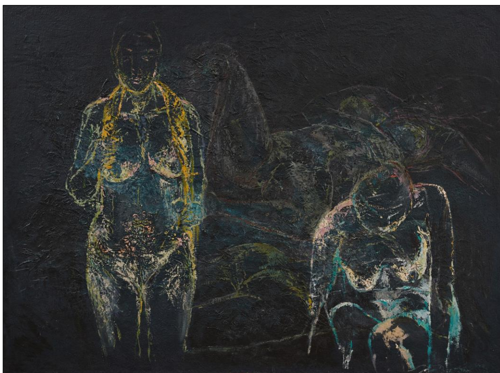
5. Marek Szczęsny, Akty czarne , olej na płótnie, 140x190 cm (2017)

work different? I have seen several of his exhibitions. At first, the set of the displayed works introduced me to a specific climate of female figures against an imaginary space. The background is neutral, which is why an erotic element pervades the picture. His art, though not entirely devoid of realistic observation, is characterized by the liberty in depicting the female figure. The models' bodies are marked with sketching effects, an attempt to arrest the light to try and capture the remains of reality. The drafts, which have obviously taken a lot of time to complete, complement each other at a glance. This mystery of perspective reveals even the temperature and complexion of the skin, whose shades of colour are intertwined with the tissue of ochre, sienna and sepia. As for the narrative, his works depict real women, but their aura transcends into the world of poetry and body lyricism.