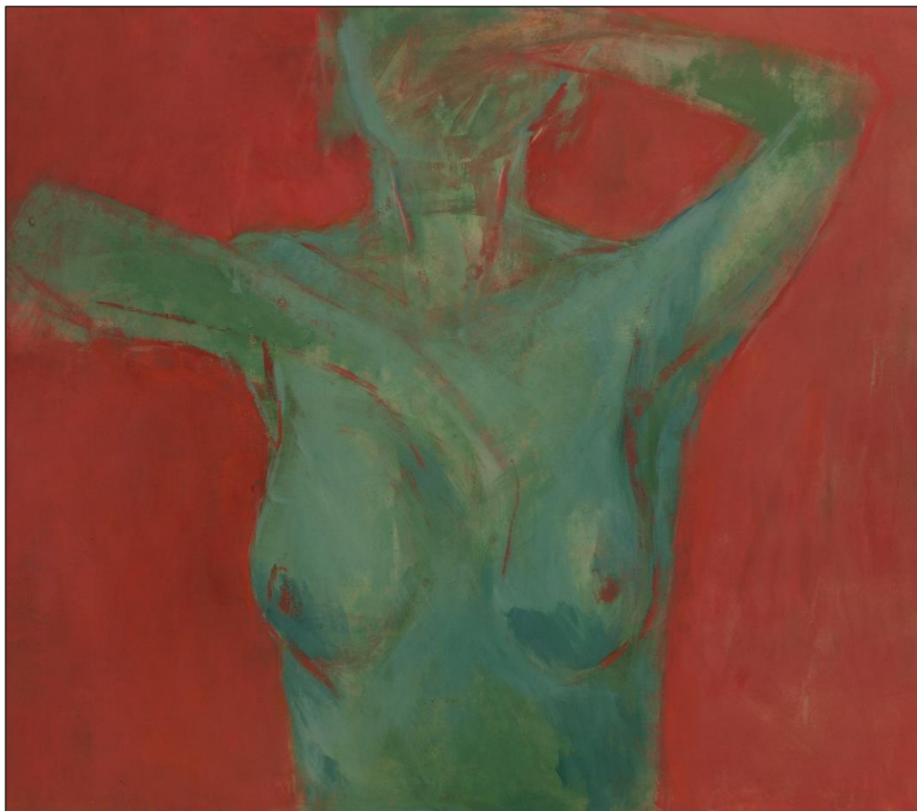
7. Marek Szczęsny, Akt czerwony , akryl na papierze, 46x65 cm (2016)

Configurations of forms are closed in the matter of lines and strokes, which by themselves should bring satisfaction to even the most demanding recipients of art. The graphics of the drawings combined with the linear effects is a curious way of imaging; I see it as an attempt to find the style through perfecting the form. It is the artist's responsibility to elaborate on the creative process and control it intellectually, even if it regards such delicate matters as human emotions. This is why the works of Marek Szczęsny reveal an awareness of the theme and a humanistic structure as well as an own manner of imaging. I will again refer to the critical analysis of the current situations: "No trend, no fashion and no art market can help make the right decision. We no longer have a binding approach to the manner of imaging, which the artist could rely on until recently" 4 .