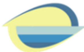
Polish Limnological Society