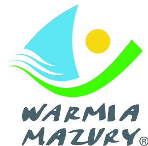
Varmian – Masurian Regional Tourist Board