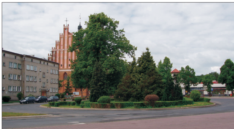
Fig. 2. Dobre Miasto – a roundabout in the middle of the historic market square

market squares in Dobre Miasto or Biskupiec Reszelski were filled in with roundabouts, thus becoming the main transportation hubs. Accumulating most of the road traffic in the town centre (e.g. the transit traffic passing through Dobre Miasto to the Polish-Russian border checkpoint in Bezledy) disturbs its small-town character of the main municipal square.