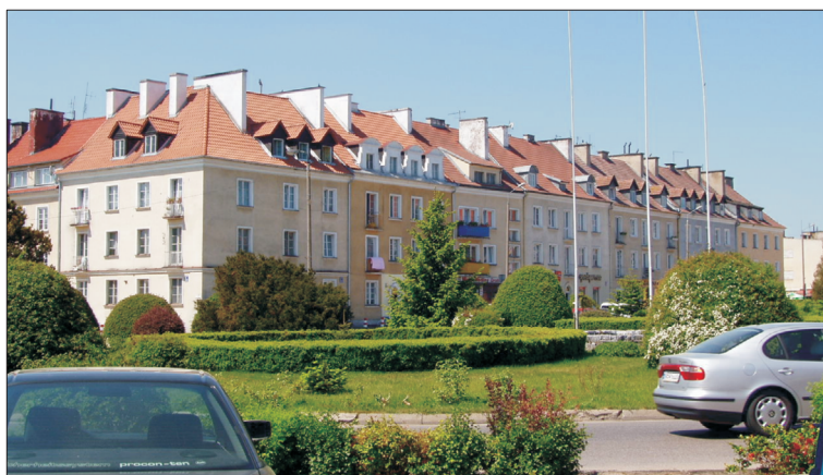
Fig. 3. Biskupiec Reszelski – a roundabout in the middle of the historic market square

Consequently, any action undertaken to renovate the spatial layout of any small town in Warmia should include the concept of restoring the central function of the inner-town area and building proper links with the other parts of a town. What we deal with here are small town communities, where the