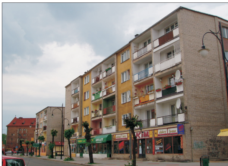
Fig. 4. Lidzbark Warmiński – houses along the northern side of the market square