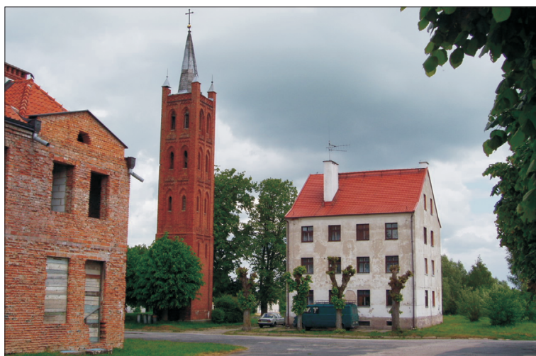
Fig. 5. Pieniężno – buildings along the eastern side of the market square – the spire of a Lutheran church and a residential house