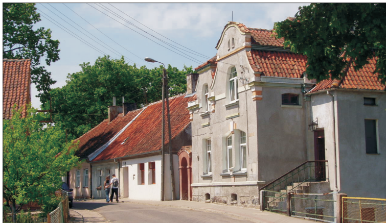
Fig. 6. Jeziorany – fragment of a developed area in the town