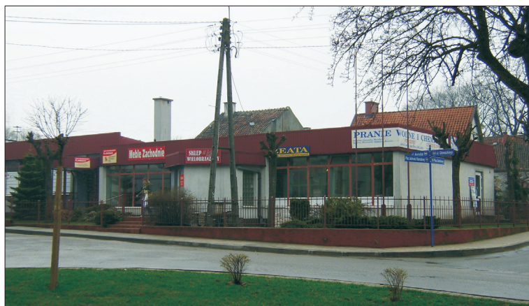
Fig. 2. Fragment of the west frontage of the Old Town Market Square Photo: M. Zagroba.