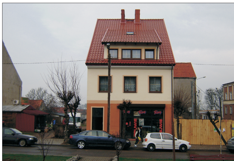
Fig. 3. Fragment of the north frontage of the Old Town Market Square