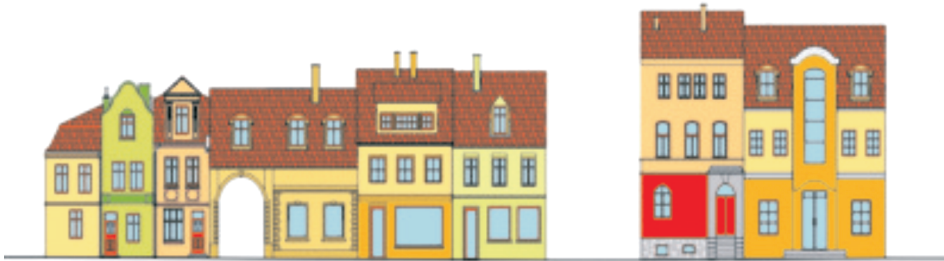
Fig. 6. The buildings along the north frontage of the square – a revalorization concept

In addition to the suggested designs of houses, a new surface of the square and some street furniture have been proposed. By suggesting to pave the surface with small stone blocks and cobbles it is hoped to achieve the benefits attributed to using natural building materials. Besides, some interesting patterns on the paved surface can be created.