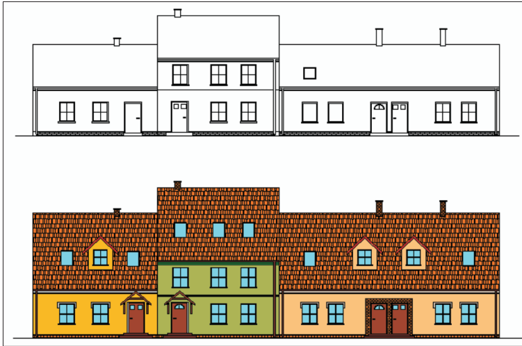
Fig. 10. The north frontage of Castle Square – the current situation and the revalorization concept Author: M. Adamczewski.

The most prominent building located at Castle Square is the one housing the Town Council. This is a three-storey building with a hipped roof, visually divided into two parts, which occupies the whole west frontage of the square (Fig. 11). In order to emphasize the stately function of the building, a historicizing, columned portico crowned by a tympanum with the town's coat of arms featuring in the middle has been designed. Several other architectural ornaments contribute to the whole design, such as cornices between the storeys and under the roof or door and window trims (Fig. 12).