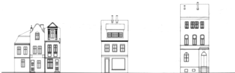
Fig. 5. The buildings along the north frontage of the square – the current situation

The arrangement of the townhouses with their roof ridges parallel to the streets, the small-scale houses and narrow land plots, the rhythm of doors and windows as well as historicizing details have all superimposed the way in which the new buildings completing gaps between the existing ones have been designed and the ones which disagree with the historic houses have been re-designed. Most of the proposed changes concern the west frontage of the square and new buildings in the north frontage. The designed architectural solutions draw on the historic buildings, and are therefore an attempt at connecting the rows of houses along each side of the market square (Figs 5, 6).