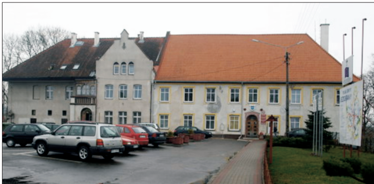
Fig. 11. The Town Council in Jeziorany – the current state

The most prominent building located at Castle Square is the one housing the Town Council. This is a three-storey building with a hipped roof, visually divided into two parts, which occupies the whole west frontage of the square (Fig. 11). In order to emphasize the stately function of the building, a historicizing, columned portico crowned by a tympanum with the town's coat of arms featuring in the middle has been designed. Several other architectural ornaments contribute to the whole design, such as cornices between the storeys and under the roof or door and window trims (Fig. 12).