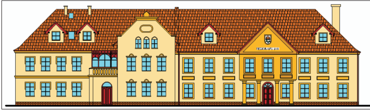
Fig. 12. The Town Council in Jeziorany – the revalorization concept