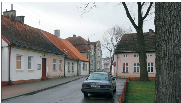
Fig. 9. Castle Square – the north frontage

Moving on from the market place towards Castle Square, we notice a protruding fragment of the row of buildings along the north side of the square. It consists of residential houses, one- or two-storey tall, with gable and pediment roofs, and with partly habitable or completely unused attics (Fig. 9). The revalorization of these building should include converting the attics into habitable space, adding more light to the existing interiors, tampering with the facades by changing the colour of the walls, bringing some order to the whole composition and completing the missing architectural ornaments.