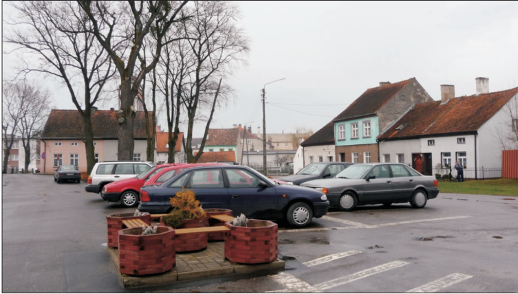
Fig. 7. Castle Square in Jeziorany – the current situation