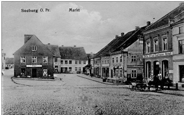
Fig. 4. The pre-war buildings on the Old Town Market Square in Jeziorany

The arrangement of the townhouses with their roof ridges parallel to the streets, the small-scale houses and narrow land plots, the rhythm of doors and windows as well as historicizing details have all superimposed the way in which the new buildings completing gaps between the existing ones have been designed and the ones which disagree with the historic houses have been re-designed. Most of the proposed changes concern the west frontage of the square and new buildings in the north frontage. The designed architectural solutions draw on the historic buildings, and are therefore an attempt at connecting the rows of houses along each side of the market square (Figs 5, 6).