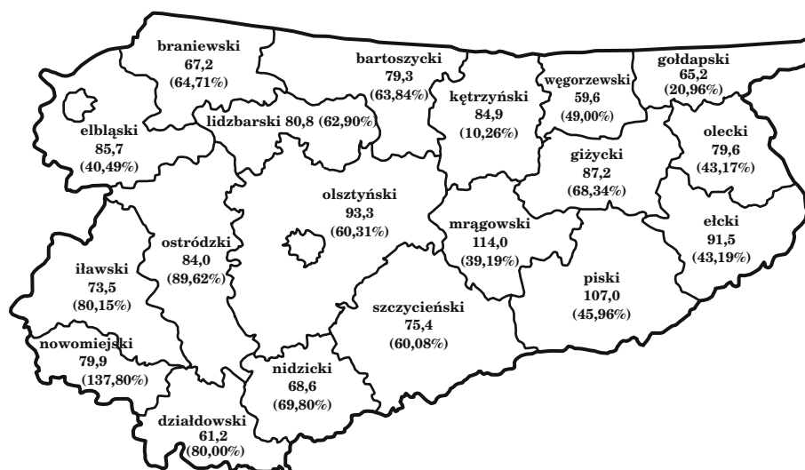
Fig. 1. Average milk sales from 1 supplier in the province of Warmia and Mazury in the quota year of 2009/2010 and the actual change as compared to the quota year 2004/2005 [K kg]

county of Nowe Miasto (an increase in milk sales from 1 supplier by as much as 137.80%) as well as Ostróda and Iława (by 89.62% and 80.15%, respectively). The lowest level of milk production concentration was observed in the counties of Kętrzyn and Goldap (by 10.26 and 20.96% respectively) (Fig. 1).