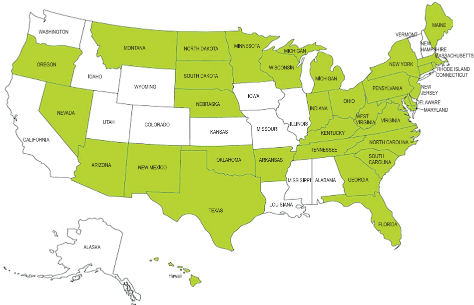
Fig. 2. States in the U.S. using readability formulas in the insurance sector